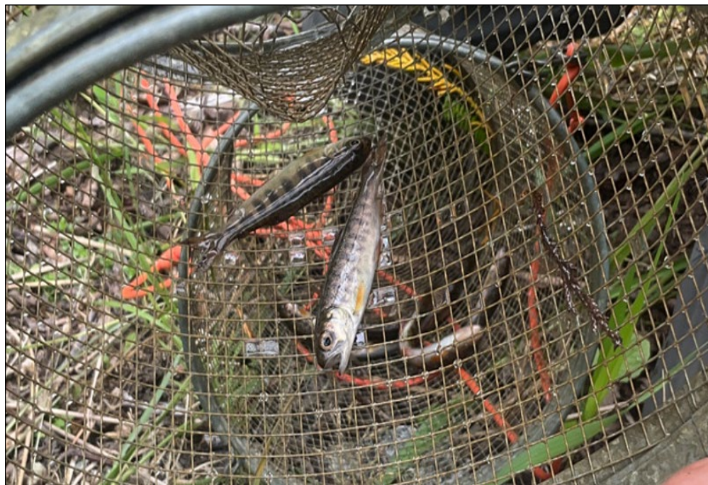
Figure 1. Juvenile coho salmon caught at waypoint 439.