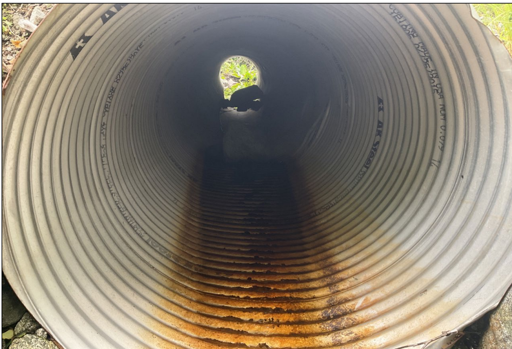
Figure 3. Culvert with low water flow looking upstream at waypoint 439.