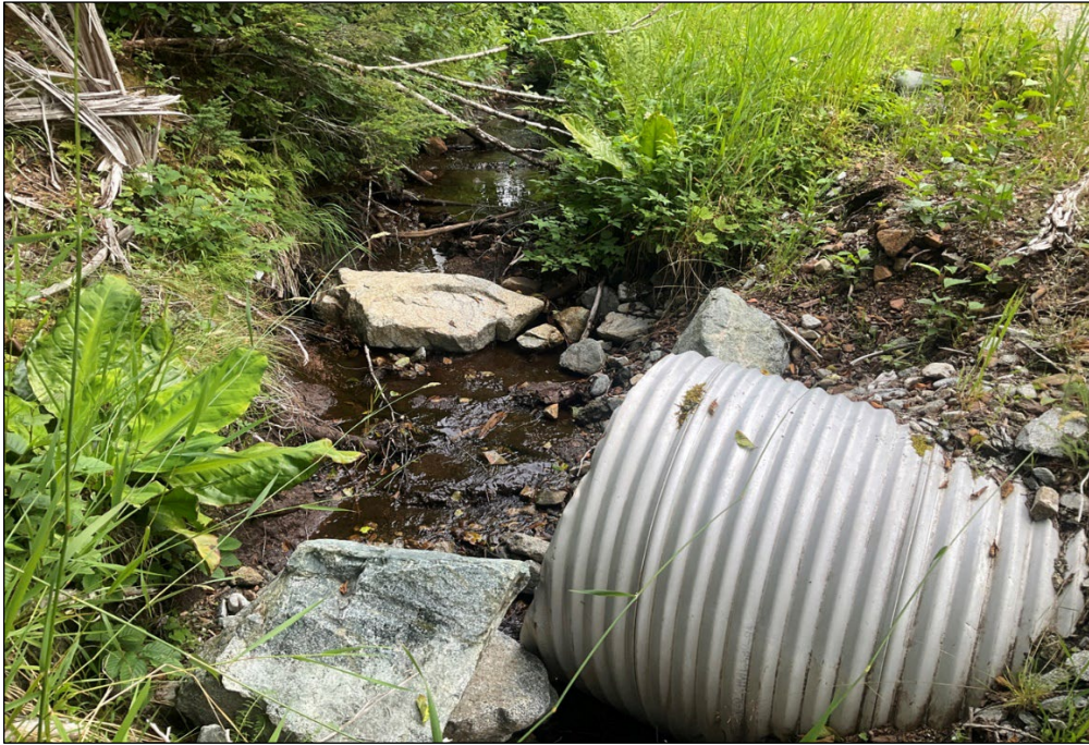
Figure 2. Culvert inlet looking upstream at waypoint 439.